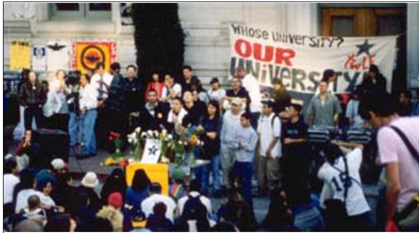
Photo: 1999 Ethnic Studies Students

Since its founding in 1855 the University of California at Berkeley has grown into one of the foremost public universities in the nation. While the University has continually served California in many ways the racial composition of the state has changed profoundly in recent decades. The Berkeley student body has mirrored this change with increasing numbers of Native American, African American, Latino, and Asian American students. The University's faculty, administration, course offerings, and funding allocations, however, have failed to meet the complex needs of the changing student and state population. Accordingly, in the great tradition of Berkeley student activism, in 1999 a group of students demanded that the university address a variety of issues, including the administration's failure to allocate faculty positions to the Department of Ethnic Studies and insufficient support for research relating to people of color.